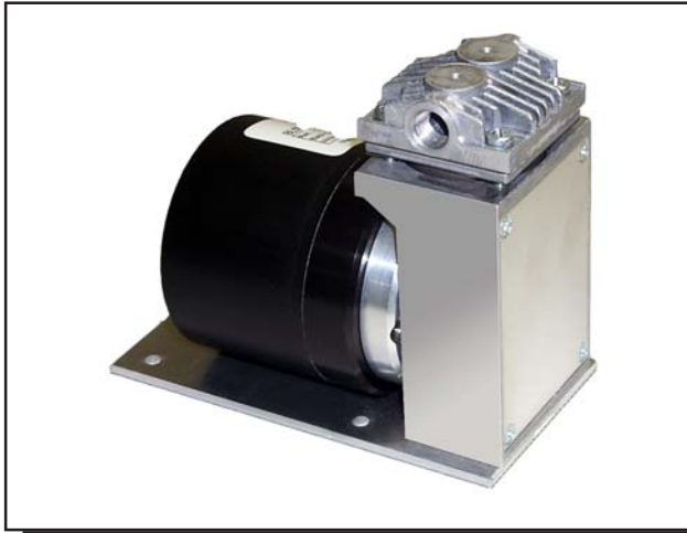
UNPK09 pump shown with optional BLDC motor